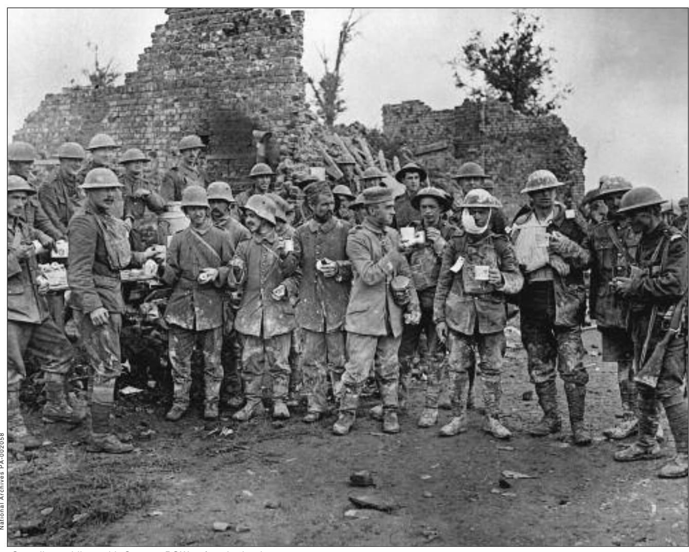
Canadian soldiers with German POWs after the battle.