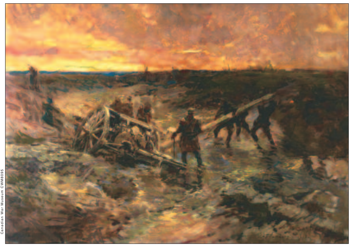
Canadian Gunners in the Mud, Passchendaele 1917, by Alfred Bastien.