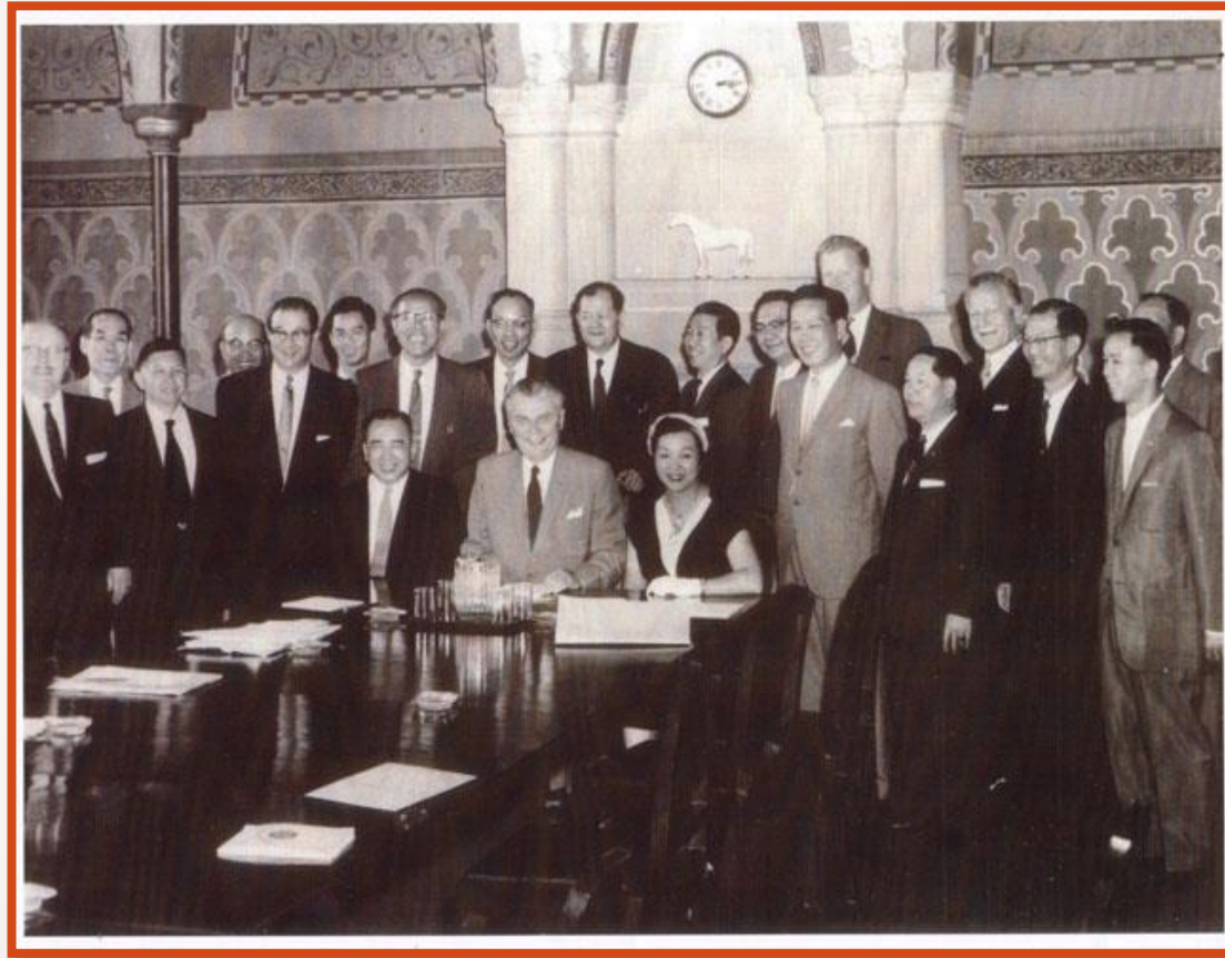
Jean Lumb Foundation, 1957