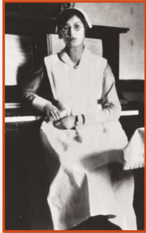
Yee 2009, 72