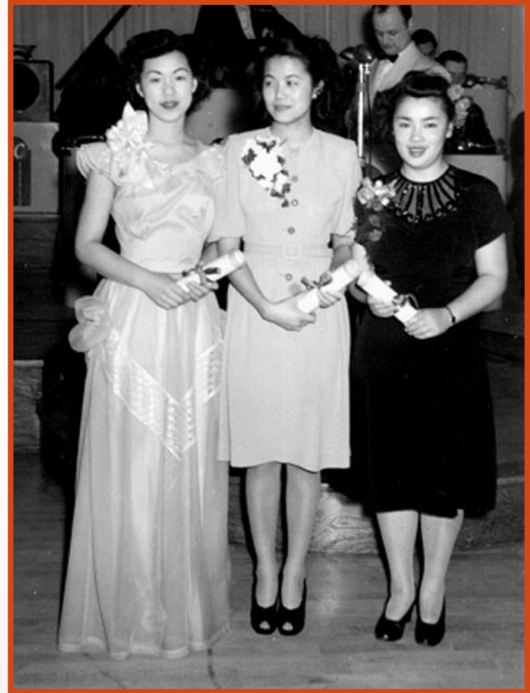
Chinese Canadian Military Museum